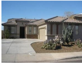
6788 Birdie Way,

Comments: Magnificent 4 bedroom, 3.5 bath home in seville featuring lots of upgraded tile flooring w/medallion foyer, formal living/dining rooms, large den, spacious family room w/dramatic vaulted ceilings and lots of recessed lighting open to the eat-in kitchen with granite counters & upgraded cabinets. The large master suite has sliding door to the backyard, large soaking tub and separate his/her vanities. On the other side of the home are 3 more