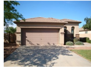
3598 Janelle Way,

Comments: Fabulous shea home in one of gilbert's finest neighborhoods with over $100,000 in upgrades - gourmet kitchen with slab granite, built in fridge and gas range - bar with beverage cooler - tons of ceramic tile flooring and tile upgrades in all the baths!!! Wood/iron stair rail - bay window in master - gas fireplace - spa with gazebo - no homes behind you for ultimate privacy -jack and jill bath - large upstairs bonus/game room- formal