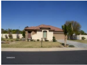
3952 Powell Court,