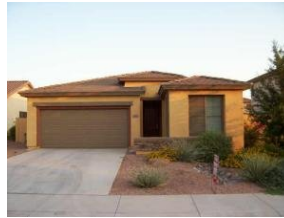
3353 Pinot Noir

Comments: Immaculate 3 bed, 2 bath home on a oversized premium corner lot in prestigious seville golf & country club subdivision. N/s exposure, generous backyard away from 2 stories, beautiful landscaping, 2in wood blinds, tile, upgraded carpet, built-in entertainment center w/ pre-wire surround sound, walk-in closet in master, epoxy garage floors and built-in cabinets. Refridgerator and window treatments convey, surround spkrs do not.