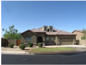
6711 Banning Street,