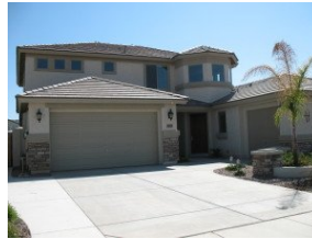
3473 Fandango Drive,

Comments: Welcome home! 5 bedroom 2.5 bath home with private pool on the golf course in seville. Clean move in ready fannie mae owned home, open split floor plan, upgraded carpet, tile flooring, guest room with full bath and separate entrance. Close before may 1 and receive extra 3.5% in closing costs or appliances! See homepath.com for special offers.