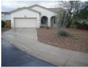
6240 Legend Court,