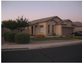
3350 Packard Drive,

Comments: "purchase this property with 5% down or a using a homepath renovation loan " sold as is, no repairs. Please write no seller's property disclosure and no clue report on page 7.