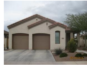
6704 St Andrews Way,

Comments: Elegant seville golf and country club living. This home has it all! Slate floors, granite countertops, s/s appliances. Dual staircases, custom built ins in den. Huge bonus room. The backyard boasts mountain views, a heated salt water pebble sheen pool. Natural gas fire pit. Also has an amazing custom outdoor kitchen. You have to see it to believe it.