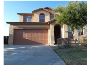
3286 Powell Court,

Comments: Short sale has offer into bank, nice home, great community. Clean home. Has tenant