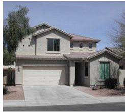
3422 Powell Way,

Comments: Great half-acre lot with rv gate on a cul-de-sac lot! Upgraded cherry cabinets, granite counters, and center island! Wonderful flowing floorplan with large family room and living room! Open den could be office or converted to a 4th bedroom, and there is still a large workstation! Large private pool with huge grassy play area left for kids. Private yard backs to a citrus orchard. This is a fannie mae homepath property. Purchase this property for as little as 3%