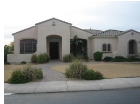
6460 Magic Court,

Comments: Move-in ready! Not a short sale and not bank owned. Regular seller! Shasta pebble tec pool! Granite countertops in kitchen! Big ceramic tile in all traffic areas! This house is loaded with upgrades! Vacant on arms lockbox. No spds, as seller has never occupied the property.