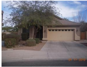
3752 Morning Star

Comments: Beautiful home in popular golf community of seville. Single level 4 bed 3 bath. Granite counter tops beautiful custom kitchen cabinets, pebble tech pool with waterfall, jack and jill bathroom, and a 3 car garage. All for $195,000!