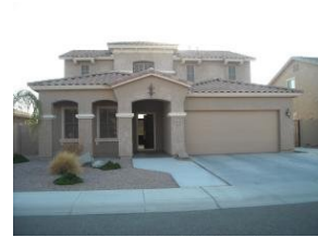
6992 View Lane,

Comments: This beautiful 3 bedroom, two bath home with original living room converted to entertainment room with double door entry (easily may be converted back to living room) located in the beautiful seville neighborhood. Home is a golf course view lot with a wonderful view of the seville country club from the great backyard of this home. Enjoy the spectacular view from the wonderful pool with great deck space for entertaining. Home has