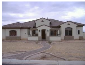
6646 Delmar Place,

Comments: There is only one word to describe this home stunning!!!! This beautiful and elegant seville home shows like a model. With warm rich colors to designer touches throughout including accent walls, niches you will love this home as soon as you walk through the front door. Bright and spacious split level with an elegant formal living/dinning room with french doors, beautiful kitchen with upgraded e cabinets, granite, and extra storage.