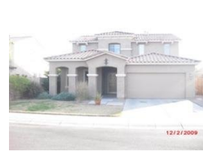
6995 Stadium Court,

Comments: Incredible seville golf course lot. The view alone will leave you breathless. Available for sale in escala at seville a gorgeous san vicente floor plan with many upgrades. This floor plan features just over 3000 sq. Ft. The home is just 3 years old and in near new condition. It features bordeaux maple recessed panel cabinets, a great upstairs laundry room with sink and extra cabinetry, granite countertops and full granite backsplash, new appliances, loft, and