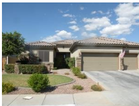
4166 Clubview Drive,

Comments: Fantastic 4 bedroom + den, 2 bath shea home with lots of open space. Home features maple cabinets, stainless steel appliances, ceramic tile throughout, open floor plan, french doors out to backyard and larger master bath with separate tub & shower. Located in the wonderful community of seville golf & country club with chandler unified school district and close shopping and dining.