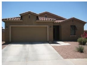
3243 Castanets Drive,