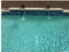
6697 Goldfinch Drive,

Comments: O this is a fannie mae homethat property. O purchase this property for as little as 3% down! O this property is approved for homethat mortgage financing. O this property is approved for homethat renovation mortgage financing.