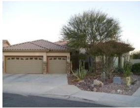
7053 Trophy Lane,

Comments: Beautiful two story home in highly desirable golf course & country club comm. Of seville. Home sits on large cul-de-sac. Beautifully landscaped w/ big grassy yard. Extended patio and sep. Area for fire pit. Home boasts 5 bdrms/3 full baths, + sep. Den w/ doors and lots of upgrades. Bed/bath downstairs, too! Open floorplan-great for entertaining. Kitchen 36' bordeaux maple cabinets, stonset counters, center island w/ breakfast bar.