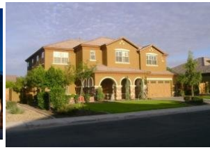
6712 Banning Street,

Comments: Buyer has backed out and we are at the end of the approval process. Hurry. This home is a beautiful and like new. There were over $100k in upgrades when built. Granite counters, stainless steel appliances, 18" porcelain tile on the diagonal, plantation shutters, alarm, water softener, ceiling fans, antique nickel hardware, ornamental stair rail, energy efficiency package. Sparkling pool, beautifully landscaped, great cul-de-sac location