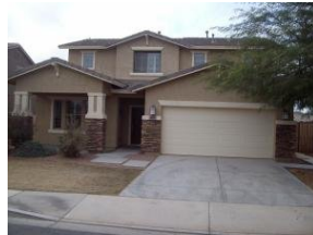
3655 Jaguar Avenue,

Comments: Meticulously maintained home in pristine seville golf & country club community. No handy man needed here! This 3 bedroom plus den, 2 bathroom home is nestled next to the golf course with mountain views. Granite countertops, enormous kitchen island w/ bar! Beautiful dark maple cabinets, black upgraded appliances, stunning french doors leading out to the clean private pool with waterfall & self cleaning system. Huge