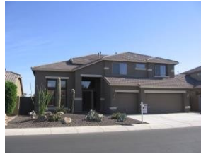
6835 Rachael Way,

Comments: Stunning seville home! Home features 3 bedrooms and a den, 2 baths, spacious kitchen with tons of cabinets, two large living areas and two car garage. Large master suite, separate tub and shower in master bath, ceiling fans in each room, water softner and more...Backyard is an entertainers paradise! Home sits on an oversized lot with two grassy areas, covered patio and self cleaning play pool! This is a must