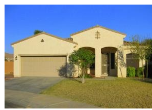
6275 Fawn Court,

Comments: **armls lkbx on gas meter by garage**wow! This is your chance to live in the exclusive golf community seville. This 4bdrm 3.5 bath is just waiting for the perfect owner is it you? The seville lifestyle offers a one of a kind private resort club with amenities typical of arizona's finest resorts. Views of the san tan mountains provide solace and relaxation. Stainless steel appliances in a kitchen that is perfect for entertaining. Bring a