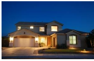
3615 Arianna Court,

Comments: Sizzling hot fnma home. Lots of awesome upgrades, granite counters, raised panel cherry cabs with honey stain, soft water system, pool/spa combo, large covered patio. Master has dual sinks, sep tub/shower, large walk in closet. Door from master leads to pool area...Wink, wink. Lots of tile, cabs in laundry, upgraded fixtures & two tone paint. Serious doubt this home will last. Fnma home qualifies for hompath financing, get