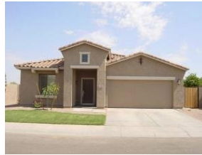
3774 Vallejo Drive,

Comments: **this property is now under auction terms. All offers must run through auction company. Large lot, private pool, several built-in media niches, tile floor, window coverings, stainless steel appliances, ceiling fans, granite counters, top of the line cabinets, 10 ft ceilings, master sitting room, several walk-in closets, separate tub & shower, double sinks, reverse osmosis, water softener, gas heat, cul-de sac lot, gated community, golf course community,