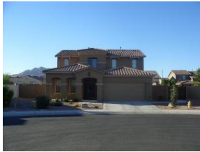
7016 Stadium Court,