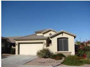
3616 Flower Street,