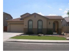
6851 Birdie Way,

Comments: Beautiful beazer in prestigious seville with all the bells and whistles! Elegant hardwood and plush carpet upgrades throughout. Additional upgrades include 42'cherry cabinets, granite, stainless appliances, gas range, wood & rod iron staircase, plantation shutters on all windows and a gas fireplace to warm any winter evening. The magical master suite w/ its accommodating facilities-seperate soaking