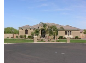
6465 Delmar Court,

Comments: Amazing home in prestigious seville golf & country club. Located within the gated community of estados this home sits on more than an acre and has an endless list of upgrades. Travertine floors, crown molding, maple cabinets, granite, custom paint, paved courtyard and circular drive, brand new pool and backyard landscaping. An absolutely stunning home that you will love. Not bank owned and not a short sale, you can actually buy