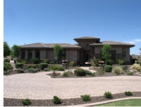
4554 Breeze Court,

Comments: Approved short sale!!! Buyer could not perform! Amazing upgrades and awesome location with extra large lot! Home is great room floorplan with 3 bedrooms plus an office that have double french doors and the master sitting room option. Wood floors and upgraded tile throughout with carpet in bedrooms, ceiling fans everywhere, ceiling mounted speakers in most of the rooms including the garage, recessed lighting with dimmers, water softener