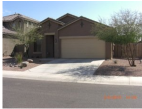
3397 Merlot Street,

Comments: Approved short sale! Ready for a quick to close!! We just need your offer!! Great cul-de-sacs lot the wonderful seville! Open kitchen with one bedroom downstairs. Great school district for the kids and close to shopping too! House is now vacant and easy to show.