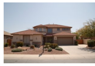
4437 Palmdale Lane,

Comments: Come see this charming 3 bedroom 2 bathroom home in the highly desirable community of seville for under $125,000. This home features a front porch, a large eat-in kitchen with all of it's appliances, and a pantry. The family room comes already pre-wired for surround sound, all you need is the speakers. The large master bedroom features a walk-in closet with a master bathroom featuring dual sinks. The back yard of this home is