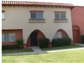
3876 30th Street,