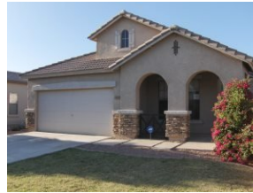
3420 Packard Drive,

Comments: When your buyer walks in they will think they are in a "model home". This is the most stunning home in seville!!!With 19" diagonal tile, granite counter tops, raised panel maple cabinets,9' ceilings,black ge appliances, 2" wood blinds,custom paint, beautiful patio with fire pit, professionally landscaped front and back, rv gate, epoxy garage floor with side service door.