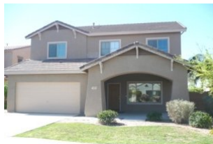
3479 Flower Street,