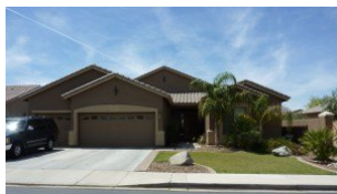
6972 Forest Avenue,

Comments: Not short sale or bank owned. Ready to move in with great salt water pool for the summer! Fast close, enter contract by 4/30/10 to meet deadline for first time home buyer tax credit. Seller will contribute up to $3,500 to buyer closing cost. Will response within 24 hours.