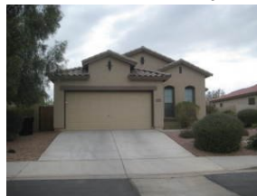
3659 Janelle Way,

Comments: Live in this elegant home with resort style amenities. The gracious floor plan lends itself to entertaining with a separate living and family room. The open kitchen has stunning dark granite countertops and dark cherry wood cabinets that provide ++ storage along with the pantry. Vacation at home and enjoy the pool, built-in bbq, and raised ramada. The community features bike & walking paths, community playground, and more! Join the seville golf &