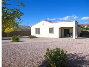
3697 Andre Avenue,

Comments: This is bank owned and ready to close.(Not a shortsale). Show and sell. Great convenient central corridor location. This light, bright, 4 bedroom 2 1/2 bath town home great open floor plan with all good sized rooms. Beautifully maintained grounds with lots of grassy open spaces and lovely community pool. The property was acquired in a foreclosure action please waive spds and clue. Thank you for showing i look forward to working