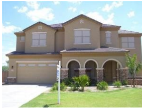
6771 Balboa Drive,

Comments: Approved short sale**buyer walked 10/28**in prestigious seville golf & country club subdivision*mt. Views*corian ctops & sink*matching blk appliances*rich cherry-finished cabinets t/o home*italian ceramic tile & hardwood flrs carried t/o home*upgraded carpet/pad in bdrms*wood blinds*ceiling fans*light & bright fam. Rm w/b-i media center & open 2 spacious kitchen*huge mstr w/lg w/i closet,raised dbl sink vanity*desert