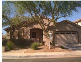
6880 Birdie Way,

Comments: Gorgeous upgraded beazer home ready to move in! 18' tile throughout, 42' cherry cabinets, stainless appliances, gas range, wood & rod iron staircase, 3' custom window treatments. Soft water & security systems. Loft, bonus room & optional 5 bedroom in addition to the large 4 bedrooms with walk in closets. One bedroom has own bathroom, other two bedrooms share jack & jill bath, and master suite has nice soaking tub