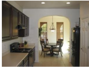
3551 Arianna Avenue,