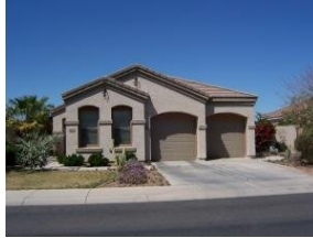
6816 Pinehurst Drive,