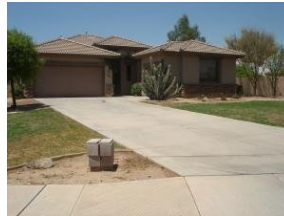
3784 Powell Way,

Comments: An acquired home, not a short sale. This home shows well. Priced to sell and sold as is. Please submit lsr or proof of funds if cash, multi offer form and questionnaire with offer. Seller may contribute towards buyers closing costs for owner occupant purchases. Be sure to inquire about smart buy home protection at homesteps.Com.