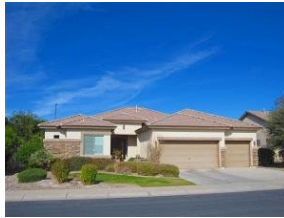
4416 Ridgewood Lane,

Comments: Spectacular home with all the bells and whistles. Home features crown molding with custom touches and paint throughout. Master bedrooms has a separate sitting area, huge game room and walk-in closets in every room but one, fireplace, along with a gourmet kitchen with granite slab countertops. Enormous resort-style backyard with sparkling fenced pool with an oversized step for lounging, grassy area and built-in bbq with cook area