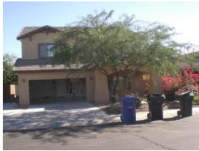
6359 Legend Court,