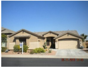
6459 Glory Court,