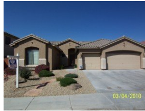
3864 Jaguar Avenue,

Comments: Nice house on cul de sac lot in seville. Mountain views, 3 car garage, courtyard, covered patio and swimming pool. Upgraded kitchen cabinets, large master closet, upstairs has loft and 4 bedrooms. Dont let west facing yard deter you, there are sunscreens on west windows on upper level.