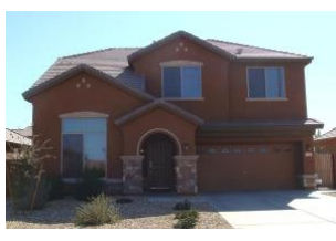
2849 Sports Court,

Comments: Not a short sale!!!**wow** 4b/2.5ba home with 3 car garage in great gilbert location. Eat in kitchen with island with breakfast bar, bay window in nook and pantry, full bath with separate shower & tub, double sinks and walk in closet in master bedroom, tile flooring through out, ceiling fans, blinds and large backyard with covered patio and patio extension. Buyer to verify all facts and figures.