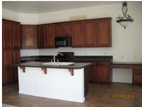
6887 Pinehurst Drive,