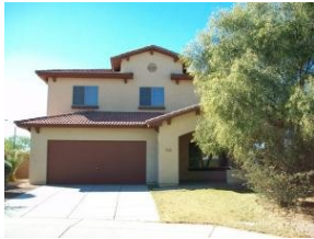
6364 Sinova Avenue,