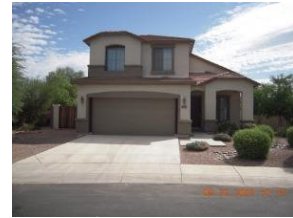
3748 Janelle Court,

Comments: Is your client tired of waiting for banks to get around to their offer? This is not a short sale or lender owned property. This single level home as the feel of a custom home. 4 bedrooms, 3 baths and the master is split. Huge (and i mean huge) master closet with california closet built ins. Very open floor plan made for entertaining. Granite countertops, stainless appliances, gas stove, pantry and kitchen island. Large north/south lot with