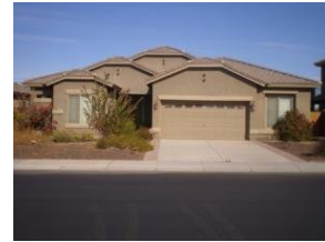
3886 Vallejo Drive,

Comments: Bank owned - sold as-is, cash only. Entire kitchen has been stripped. Great 3 bedroom, 2 bath home in seville, corner lot, next to elementary school, spacious backyard, north/south exposure and more!