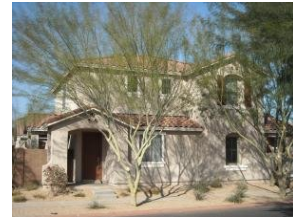
3850 Palmer Street,

Comments: Treasure!!! Immaculate beauty sitting on large corner lot! Spacious arizona living defined, two master bedrooms, and three additional multi-faceted bedrooms you can convert to media, den or home office. Primary master bedroom is a complete retreat featuring a jetted tub and private exit to back yard oasis. Spacious formal living and dining rooms. Kitchen features large island, granite counter tops, custom maple cabinetry any chef