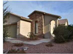
7015 San Jacinto

Comments: Fannie mae owned property. Beautiful 5 bedroom, 4 bathroom located in seville golf and country club. Home sits in a cul-de-sac and next to park. Master bedroom and 1 guest bedroom located downstairs. 3 bedrooms, 2 bathrooms located upstairs with large loft. The junior-high is payne middle school. This property is approved for hompath mortgage and hompath renovation mortgage financing. Please contact agent for more information.