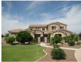
6446 Honor Court,

Comments: Gorgeous single level home in the beautiful seville subdivision of gilbert. Reo property that is in excellent condition and priced to sell quickly. Open the door to a spacious family room that leads to the luxurious kitchen. The kitchen offers lovely staggered cabinetry, granite counters and much of them, black appliances, a pantry and a large island. You will also find an eat in kitchen area as well as a formal dining area. Breathtaking! The master bedroom has a