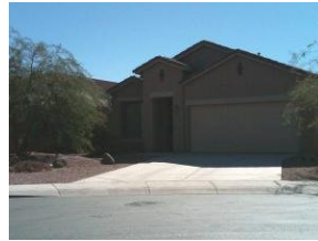
3491 Turnberry Drive,

Comments: It's got the wow factor! - The moment you drive up the elevation and pristine landscaping will draw you in. You'll love the gourmet kitchen w/ center island, staggered 42" cabinets and stainless appliances. The 4th bedroom is set up as a "junior suite" with a full bathroom. Like new without the wait. Landscaping, window treatments and all the upgrades are already done. The covered patio overlooking the premium lot makes for the perfect