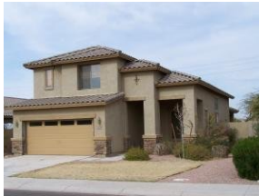
3424 Pinot Noir

Comments: Beautiful corner lot, 3 bedroom 3 bath home! A must see! Granite counter tops! This is a fannie mae homepath property. Purchase this property for as little as 3% down! This property is approved for homepath mortgage financing. This property is approved for homepath renovation mortgage financing.