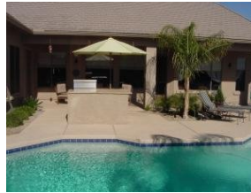
4405 Palmdale Lane,

Comments: Lender owned, sold as/is, where is. All facts, figures and measurements to be verified by buyer, including those in the mls. Buyers must receive an lsr through wells fargo prior to submitting offer. Seller has never occupied property and is unable to provide spds or clue report. Accepted offer will be countered by seller with counter addendums and title company information.