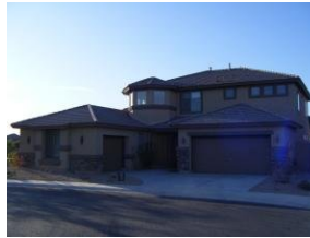
3586 Riopelle Court,

Comments: Approved short sale!!! Can close before tax credit deadline! Buyer backed out. Stunning seville golf course community.....This home has it all... The most desired floorplan on a very large & private lot, back to no one, only single level on the side... 3 bedrooms + den/office... 16' tile in all major areas and custom carpet everywhere else... Granite counter tops... Custom built entertainment center... Plantation shutters... Fans